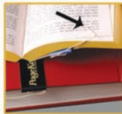
Spring stays in place as you turn the page.